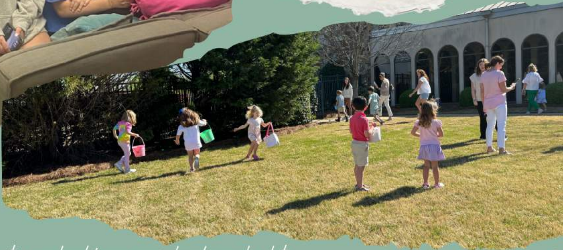
Just a few photos from our Easter weekend & one special welcome back to 428 for Sara Binet from our arrr-mazing youth group!