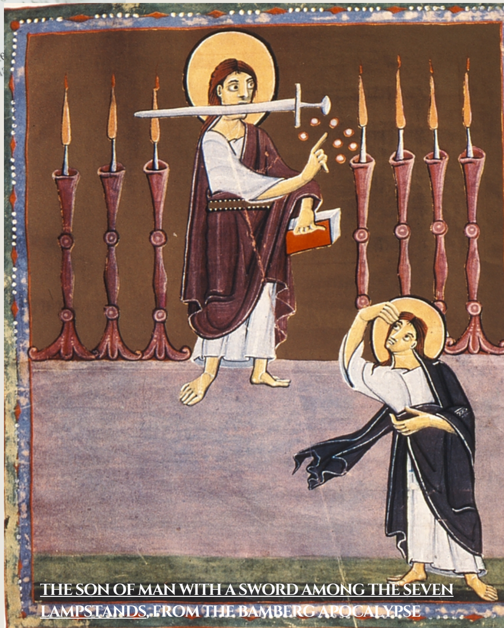
THE SON OF MAN WITH A SWORD AMONG THE SEVEN LAMPSTANDS, FROM THE BAMBERG APOCALYPSE