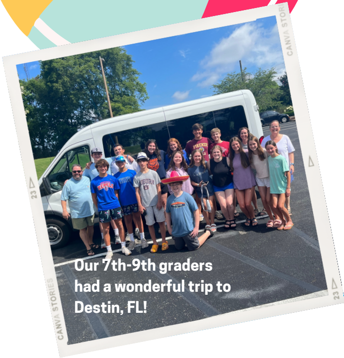
Our 7th-9th graders had a wonderful trip to Destin, FL!

The pool is open at the McFarlands' house on Sundays for youth from 4-6 pm!