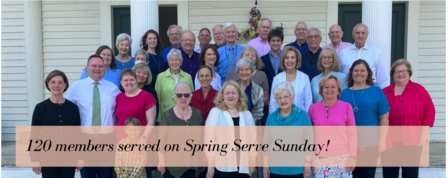
120 members served on Spring Serve Sunday!